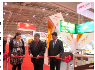
Consul General Mauricio Toussaint opens the Mexico pavilion

cal and scientific exchange with other countries, including Canada, as a way to accelerate production and commercial trade processes. •The relationship between Mexico and Ontario is especially significant given that 75% of the total trade between Mexico and Canada is with Ontario. •Funding for projects listed on the Toronto Stock Exchange (TSX) are significant given that last year the TSX recorded $10,000 million dollars (mdd) in the mining sector. Notably, $1,000 mdd from the TSX was for projects in Mexico. • There are internal barriers within Canada associated with interprovincial trade which make trade difficult. For example, certain agricultural products require specific treatments depending on the Canadian province for which they are destined.