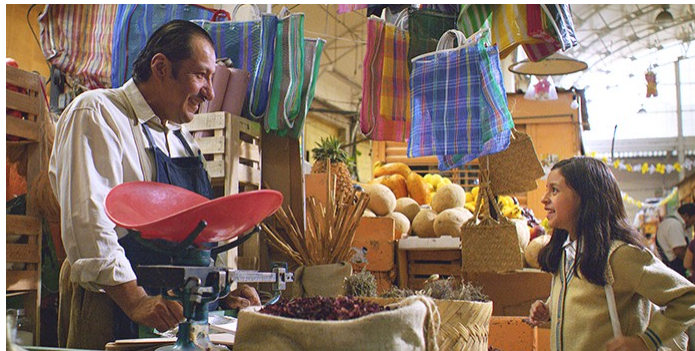
Scenes of "Cinnamon"

with her. The two cooks' culinary styles meet and challenge one another, demonstrating the passion and vibrancy of Mexican gastronomy. María joins both her grandmother and Rosi, practicing and sharing her own talent. Delighted by Tere's return, the neighbourhood fills the restaurant once more.