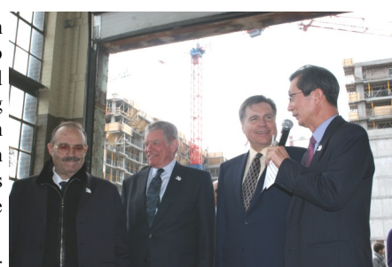
Mario Vazquez Raña (left) with the members of the Organizing Committee for the Toronto Pan American Games 2015

The Organizing Committee hosted a dinner for the PASO delegation which was attended by various public figures; representatives from the governments