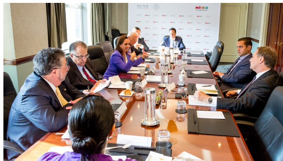
Working visit to Toronto

She noted that innovation and competitiveness are priorities for the tourism sector, and accordingly, Mexico is working to diversify its