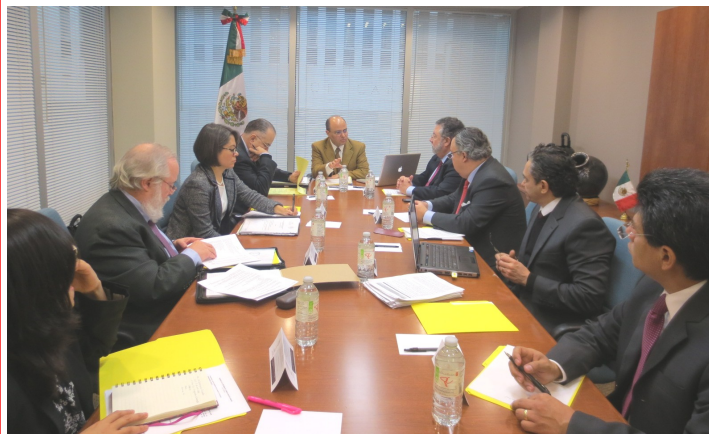
Mexican Ambassador and Consuls to Canada meet at the Consulate General of Mexico in Toronto

Because of Canada's size and its political system, provincial and local governments play an important role in topics such as innovation, higher education, research, business ventures, and gender equality.