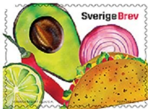
Left: The “Taco” postage stamp.

The new stamps were released on March 17; aside from the design depicting tacos, there were also designs showing sushi, pasta, and traditional Swedish food, among others.