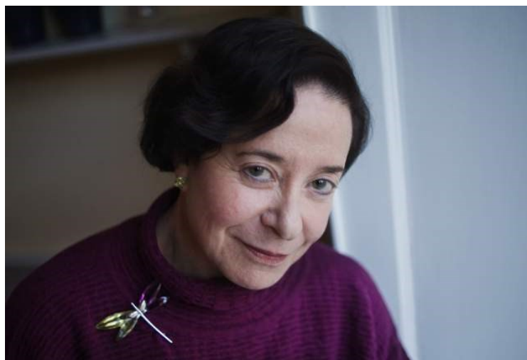
Top: Mexican poetess Gloria Gervitz.