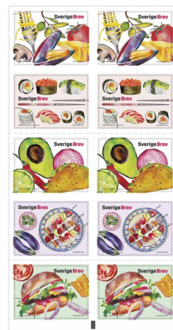
Right: The entire series honoring the world’s food in Sweden newly released by PostNord Sverige.