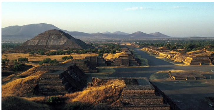
View of Teotihuacán.

In Teotihuacán, the Pyramid of the Sun, with its 365 steps – one for every day of the year – and the Pyramid of the Moon, together with the perfectly aligned Causeway of the Dead, combine to make up one of the largest and most imposing ceremonial centers in all Mesoamerica, which year after year attracts hordes of tourists from within Mexico and overseas, who are fascinated by the grandeur of Aztec culture.