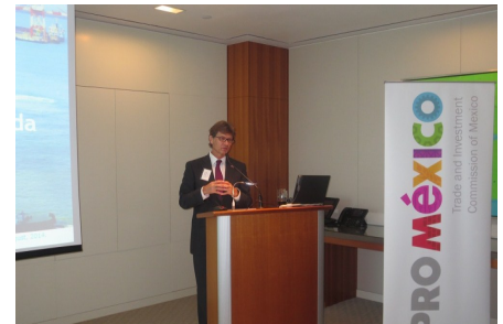
Enrique de la Madrid, Director General of BANCOMEXT

The video of the ceremony can be viewed at the following link: https://www.youtube.com/watch?v=vAT3x_FC2YU&feature=plcp