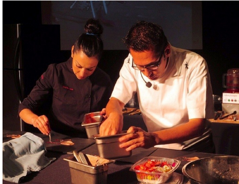
Chefs at the final competition