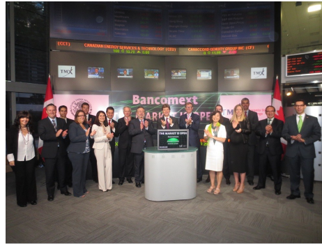
Toronto Stock Exchange (TSX) opening ceremony