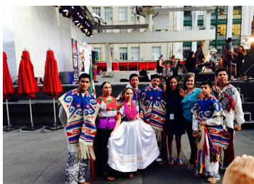
Folk Dance Group Corcoví