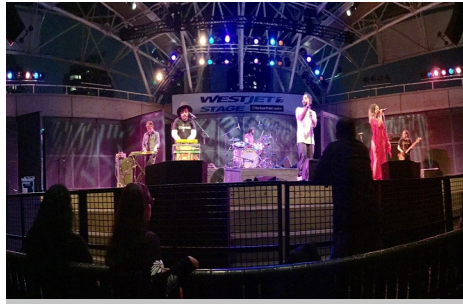
Group Compass concert

Mexico played a major role in the 10th Ritmo y Color Festival, one of Toronto's biggest Latino festivals, which took place at the Harbourfront Centre July 17-19, and included family activities, contemporary dance performances and high-profile musicians playing in a range of genres that displayed the cultural vitality of different local and international communities of Latin America.