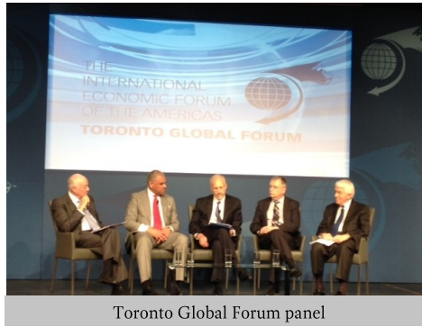
Toronto Global Forum panel

The Global Forum featured the presence of political and financial leaders from all over the world, who discussed the uncertainty of the current climate while also expressing their optimism about the future. The featured speakers included: David Johnston, Governor General of Canada; Kathleen Wynne, Premier of Ontario; John Tory, Mayor of Toronto; Philippe Couillard, Premier of Quebec; Lisa Raitt, Canada's Minister of Transport; Ed Fast, Canada's Minister of International Trade; Tony Clement, President of the Treasury Board of Canada; Shimon Peres, former president and prime minister of Israel; John D. Negroponte, Former US Secretary of State; Luis Almagro Lemes, Secretary General of the OAS; Germán Vargas Lleras, Vice President of Colombia; Alexander Mora, Costa Rica's Minister of Foreign Trade; Andrés Rozental, Eminent Ambassador of Mexico; and the CEOs of various transnational corporations. Among the top issues discussed were: the economic situation in Greece and the financial rescue request it has made to the members of the Eurozone; the severe falls of the Chinese stock market; the slow