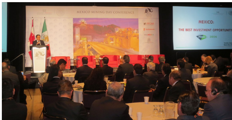
Secretary of Economy Ildefonso Guajardo speaks to international mining developers attending Mexico Mining Day