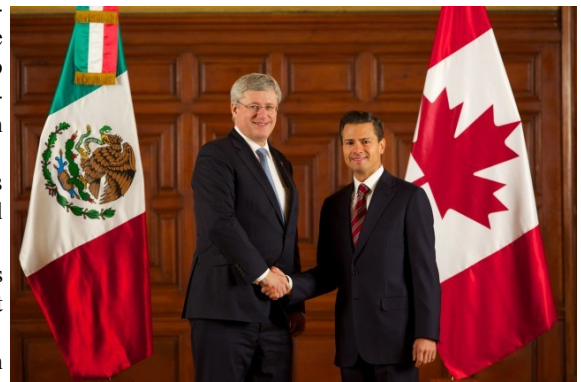
Prime Minister of Canada Stephen Harper and President of Mexico Enrique Peña Nieto

that today more than 200 Canadian businesses operate in Mexico, creating new opportunities for themselves and for Mexicans, thereby continuing to strengthen bilateral investment.