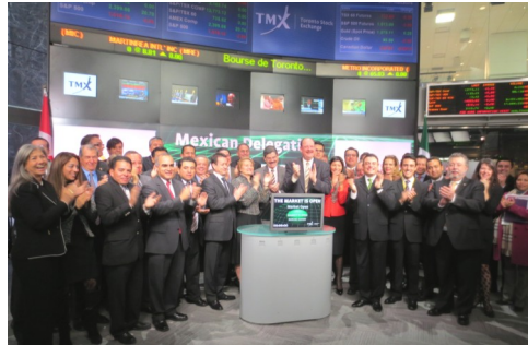
The Mexican delegation opens the TSX