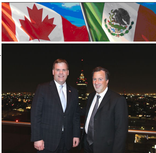
Minister John Baird and Secretary José Antonio Meade

Secretary Meade and Minister Baird agreed to keep in close communication about the