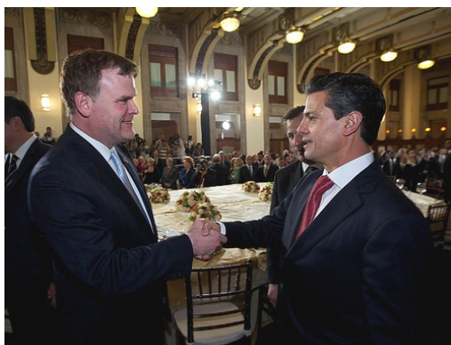
Minister John Baird and President Enrique Peña Nieto

3) Promote Mexico's value in the world. We want the world to know everything about Mexico: Our culture, our history, our arts, our natural beauty and, especially, Mexico's economic opportuni-