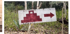
La Ultima Película

More information about the Toronto International Film Festival schedule can be found at: www.tiff.net .