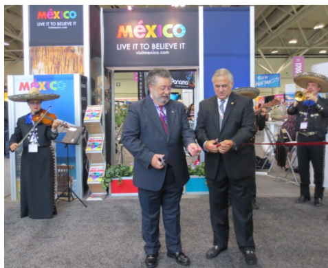
Consul General Mauricio Toussaint and Mexico City Minister of Tourism Miguel Torruco

Also present at the inauguration were the director of the MTB in Canada, Rodrigo Espoñda, the trade commissioner for ProMexico in Toronto, César Bueno, local tour operators and media agencies.