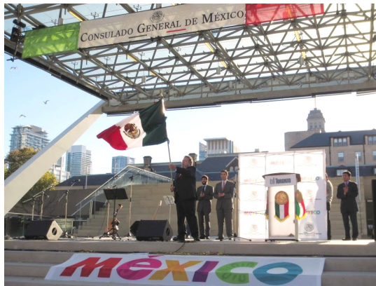
Consul General Mauricio Toussaint led the Cry of Independence ceremony

The Consulate General hosted an informa-