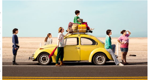
Scene from the film “The Amazing Catfish”