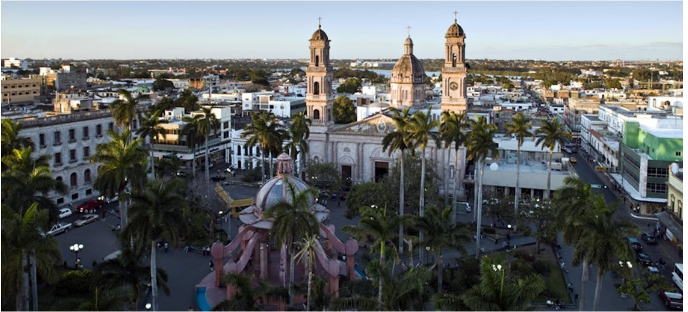
Tamaulipas.

Tamaulipas is a rich and diverse state where history and modernity have come together, forming an almost perfect balance in which culture and nature converge, giving travellers the opportunity to live unique experiences in this beautiful tourist destination.