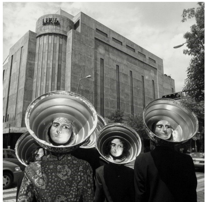
Foco alAire