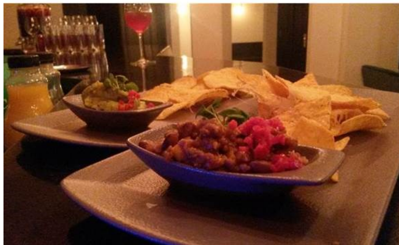
Mexican delicacies and drinks were served to the public during the event.