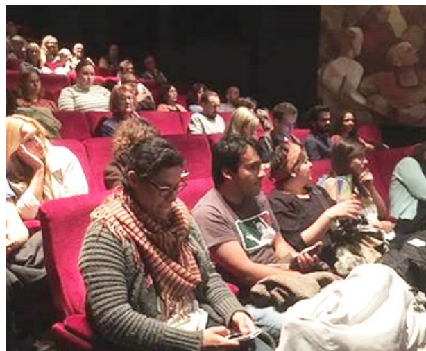
Left: Promotional poster for the Spanish Language Film Cycle in Gothenburg. Right: Audience members at the screening of "In the Middle of Heaven."