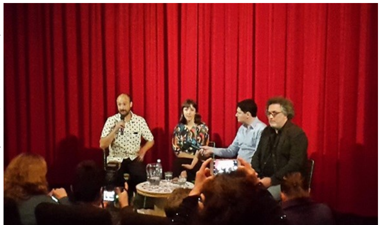
Seminar on collective memory held at the festival.