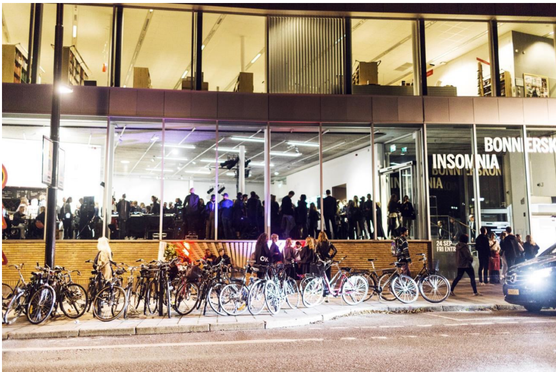
Bonniers Konsthall in Stockholm during the all-night Insomnia exhibit in September.

The exhibit will remain open to the public until January 22, 2017.