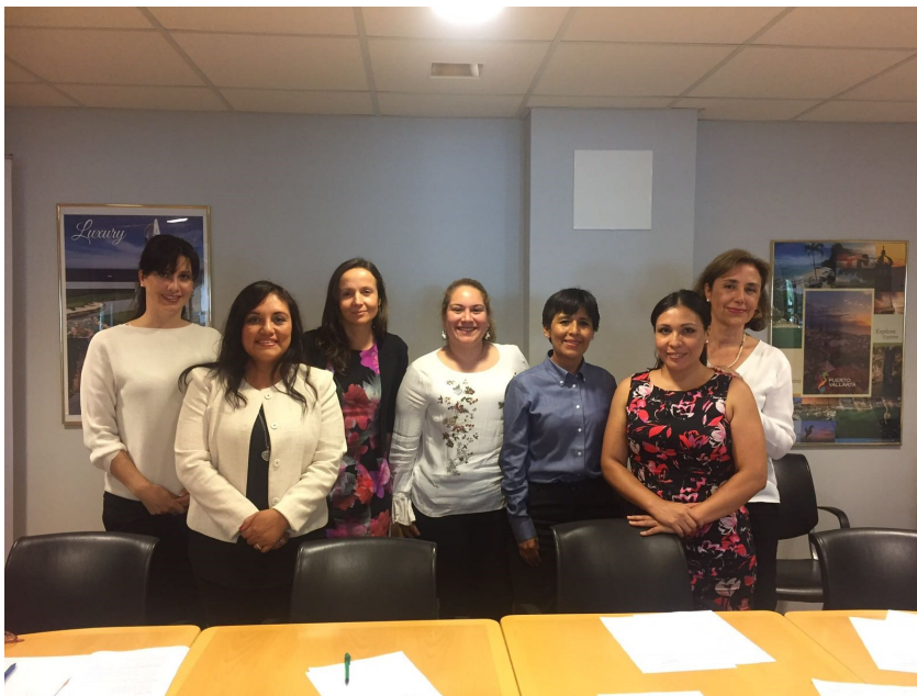
The Third Working Meeting of Consuls of the Embassies of Latin America and the Caribbean in Sweden (GRULAC) was held at the Mexican Embassy in Stockholm on August 15, 2018.