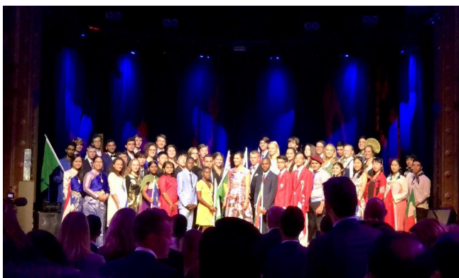
The ceremony for the Junior Water Prize on August 28.