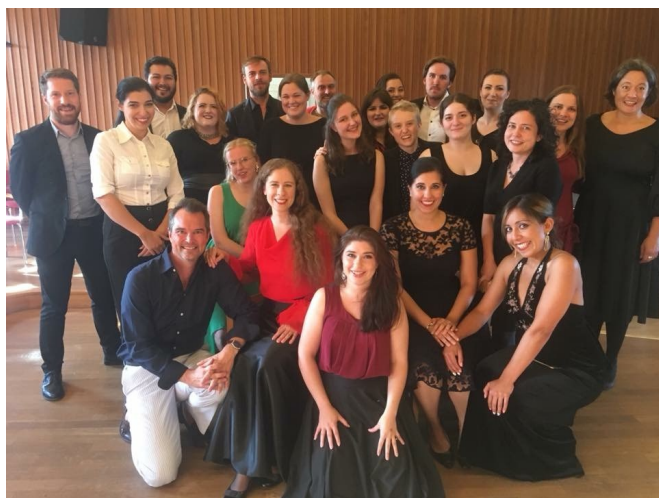
The Mexican musicians with the other music professors and students at the Kashu-do course in Nyland.