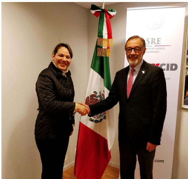
On August 21, the new Ambassador of Paraguay to Sweden, Romina Taboada, made a courtesy visit to Ambassador Gasca Pliego at the Embassy of Mexico in Stockholm.