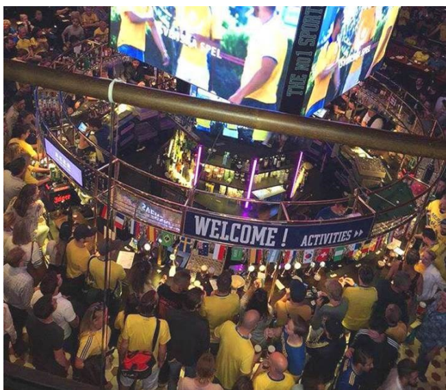
The audience at O'Leary's in Tolv during the Mexico-Sweden match.