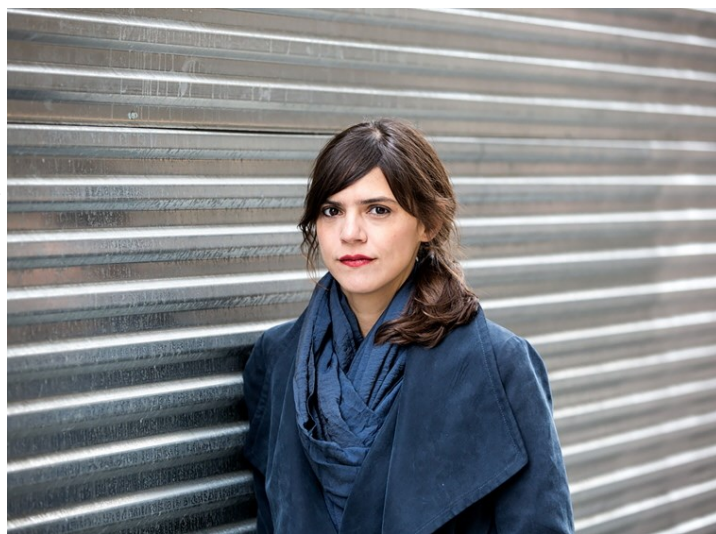
Valeria Luiselli.

Para más información, visita la página de Kulturhuset .