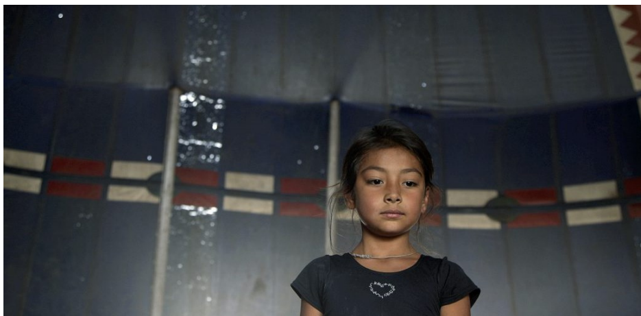
The winner for the Prize for Best Documentary Film, "Tempest," (Tempestad), by the Mexican Tatiana Huerzo.

The 3rd edition of the Latin American Panoramica Film Festival was held in the city of Stockholm between September 20 and 24. The program included a selection of 19 feature films and five short films from 14 Latin American countries, which were shown in some of the most important